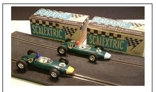
The old Lotus race cars Mark and I used to 'play' with.

All such events were based upon the U.K. Ordinance Survey Land Ranger 1:50000 scale maps. Two hundred and forty maps in total define the UK mainland, with each map sheet covering an area of 40 kilometres by 40 kilometres. They are the most detailed maps in the