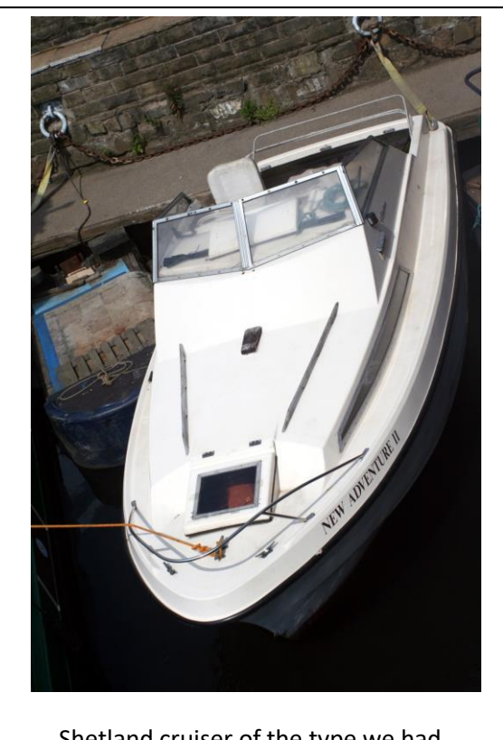
Shetland cruiser of the type we had.

We moored the Shetland initially at The Mumbles in Swansea Bay and used the boat for days out in the Bay, taking trips down the coast to the beaches along the Gower Peninsular. All very exciting and new for all of us, none of us having had any previous experience of boats or the sea. The sea current in the Bristol Channel on the changing tides is quite fierce, running as it does at five or more knots. Making headway against this current gives you the impression that the boat is moving really quickly but this is only relative to the water, relative to the land you are moving 5 or so knots slower. A bit like walking the wrong way along an airport terminal travelator. A lot of work done to cover a short distance. Amazing how much fuel you needed to get a boat from A to B in these circumstances. A lot less miles per gallon than you get in a car.